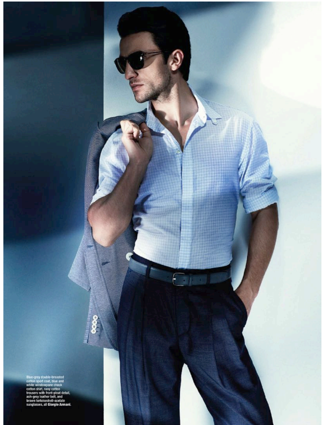
Blue-grey double-breasted cotton sport coat, blue and white windowpane check cotton shirt, navy cotton trousers with front-pleat detail, ash-grey leather belt, and brown tortoiseshell-acetate sunglasses, all Giorgio Armani.