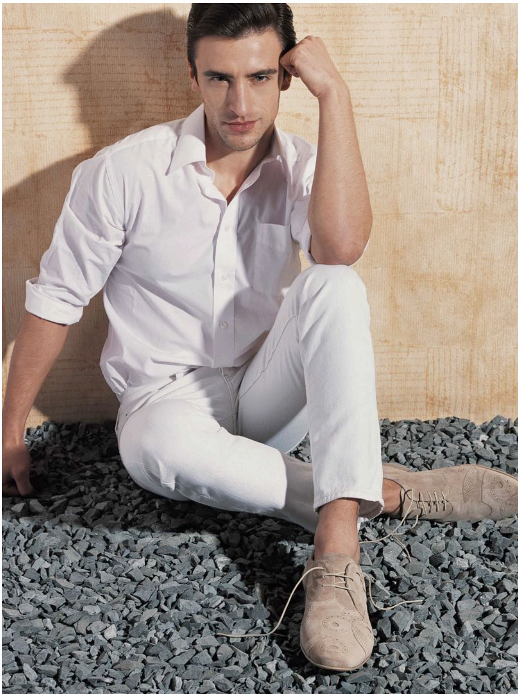
Cologne - Impekovener Str. 29