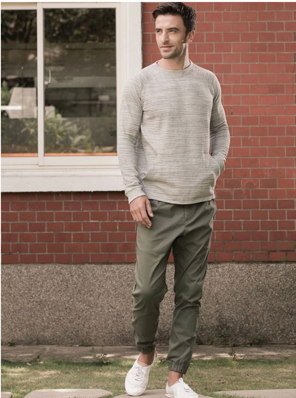
Cologne - Impekovener Str. 29