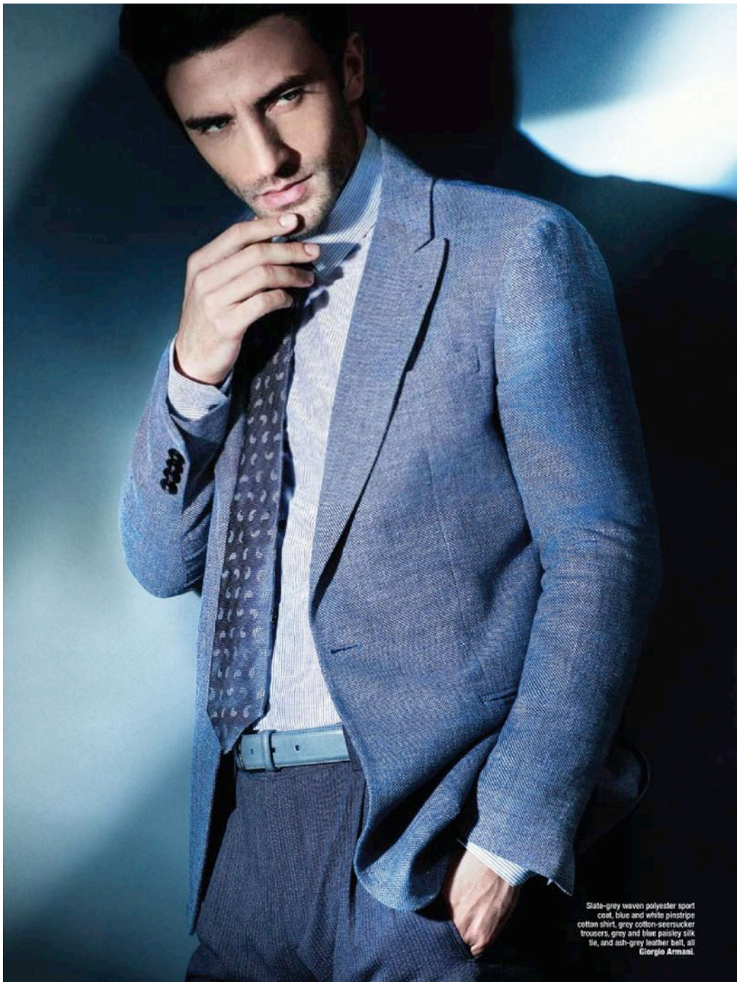
Slate-grey woven polyester sport coat, blue and white pinstripe cotton shirt, grey cotton-suesucker trousers, grey and blue paisley silk tie, and ash-grey leather belt, all Giorgio Armani.